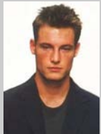
A modern take of the military hair do, textured top with razor short sides