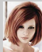
A modern twist on a classic bob