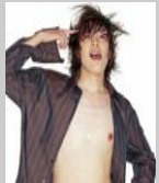
Funky retro a variation on the mullet