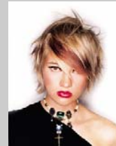
Short and choppy with multi layers and highlights