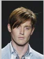
Long layers at the front with short back