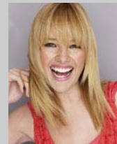
Long fringe with long feathered layers adds a modern touch to long hair