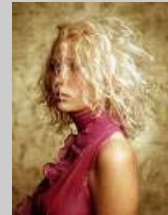
Wavy bohemian waves giving a grunge- chic